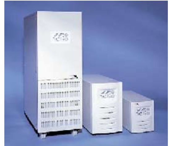
The Falcon SG Series™ 800VA - 6kVA on-line UPS features true double conversion on-line, sinewave design to provide superior power protection for a wide range of applications.

My newest Falcon UPS is an industrial grade model that runs the entire cable room: servers, monitors, routers, cable modem, and Ethernet switches. I'd had it about a month when we got a live test power failure. Actually it was three power failures. The first one was short, and I hadn't shut everything down when the power came back on. The winds were still howling though, and I wasn't surprised when the power failed again, this time for a couple of hours.