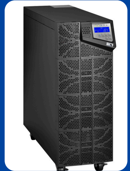
FN Series Scalable N+1 UPS Tower- 3kVA to 40kVA

"The speed of delivery and customer service of Falcon has been excellent and build quality of the FN Series units are top notch," said Murphy. It's been great from a support standpoint that Falcon has been able to provide the units so quickly. Should we lose a unit, we know that we can get it replaced fast."